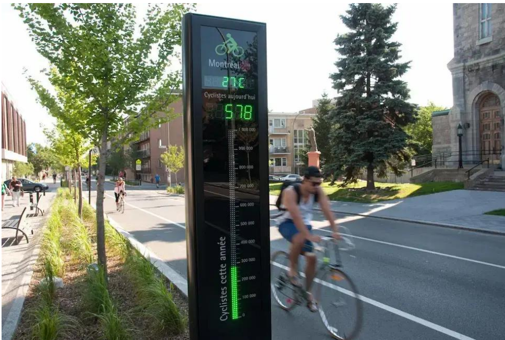
Figure 2. Eco-DISPLAY Classic +